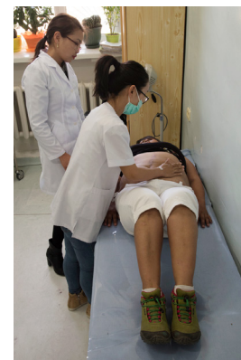
(Photos of program activities from "Hepatitis Free Mongolia, Phase 1" in 2017. From left to right, blood draw, ultrasound exam, FibroScan exam, physical exam.)